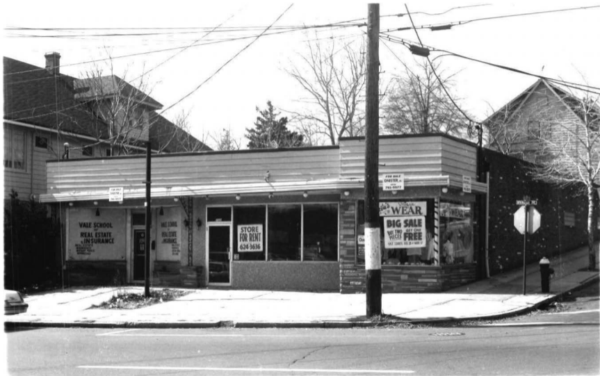
Board of Realtors of the Oranges and Maplewood